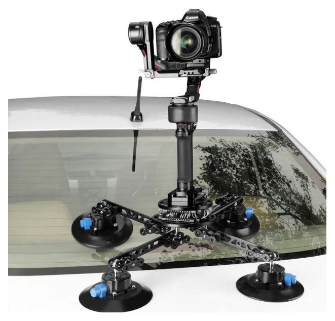
(SHOWN WITH OPTIONAL ACCESSORIES)

Warranty: We offer one year warranty for our products from date of purchase. Within this period of time, we will repair it without charge for labor or parts. Warranty doesn't cover transportation costs nor does it cover a product subjected to misuse or accidental damage. Warranty repairs are subjected to inspection and evaluation by us.