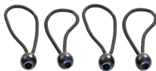
4x Elastic Stoppers