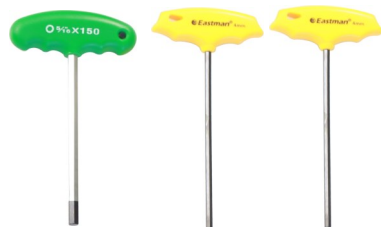
3x Allen keys