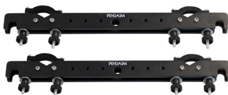
2x End Feet