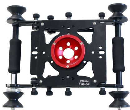
Camera Dolly with 100mm bowl

Please inspect the contents of your shipped package to ensure you have received everything that is listed below.