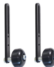
2x Safety Wheels