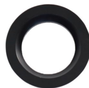
75mm Conversion Ring