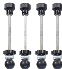
4x Adjustable Leveling Legs