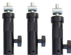
3x Junior Pin Adapters